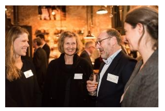
vibrant network with 270 members