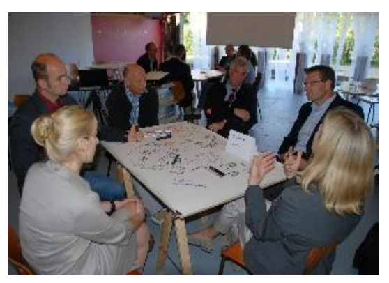
knowledge through expert groups